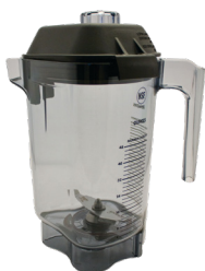
1.4 L Advance Container with 2 Piece Lid and Blade Assembly