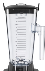
1.4 L Standard Container with Lid and Blade Assembly