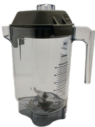
1.4 L Advance Container with Lid and Blade Assembly