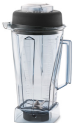
2.0 L Standard Container with Lid and Blade Assembly